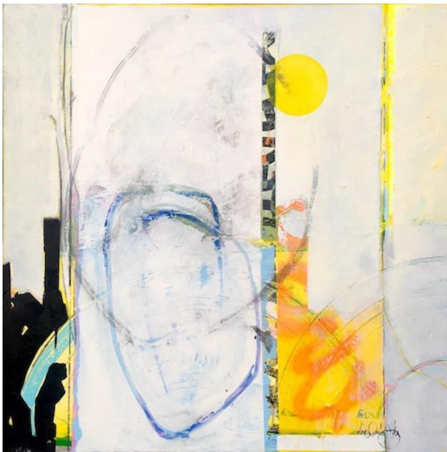
4/ Virgo, 70x70cm, 2017