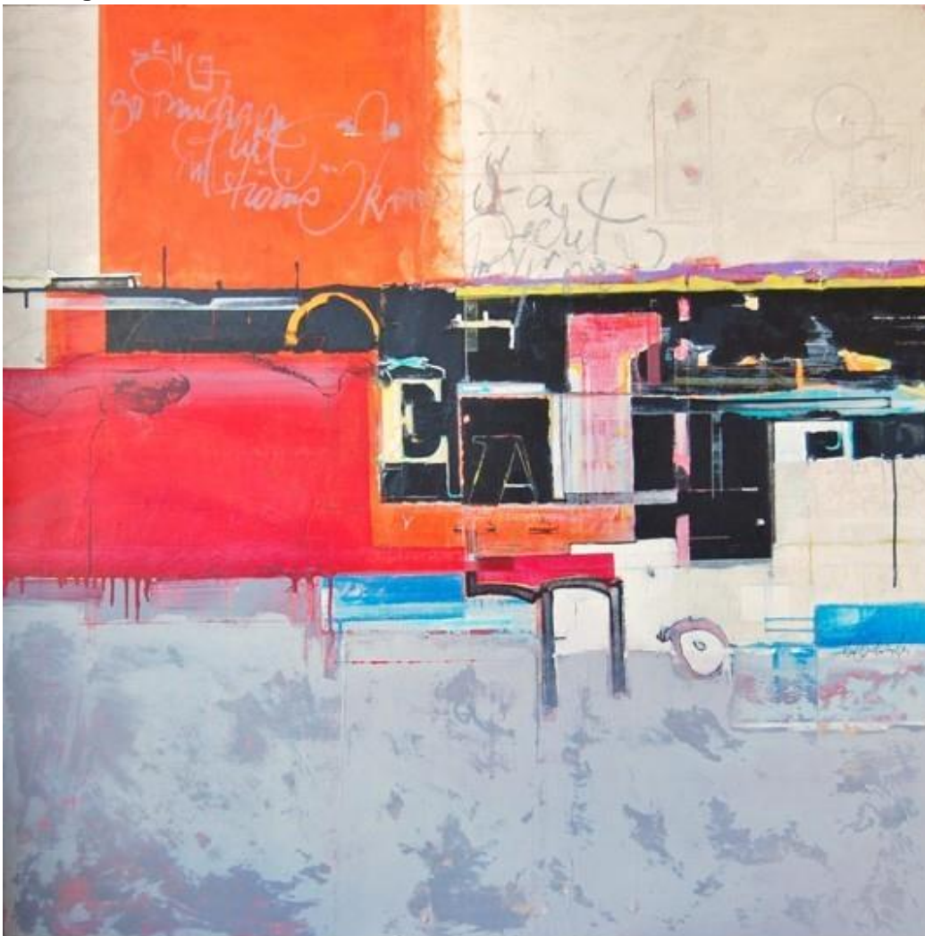
1/ Long Gone, 120x120 cm, 2011