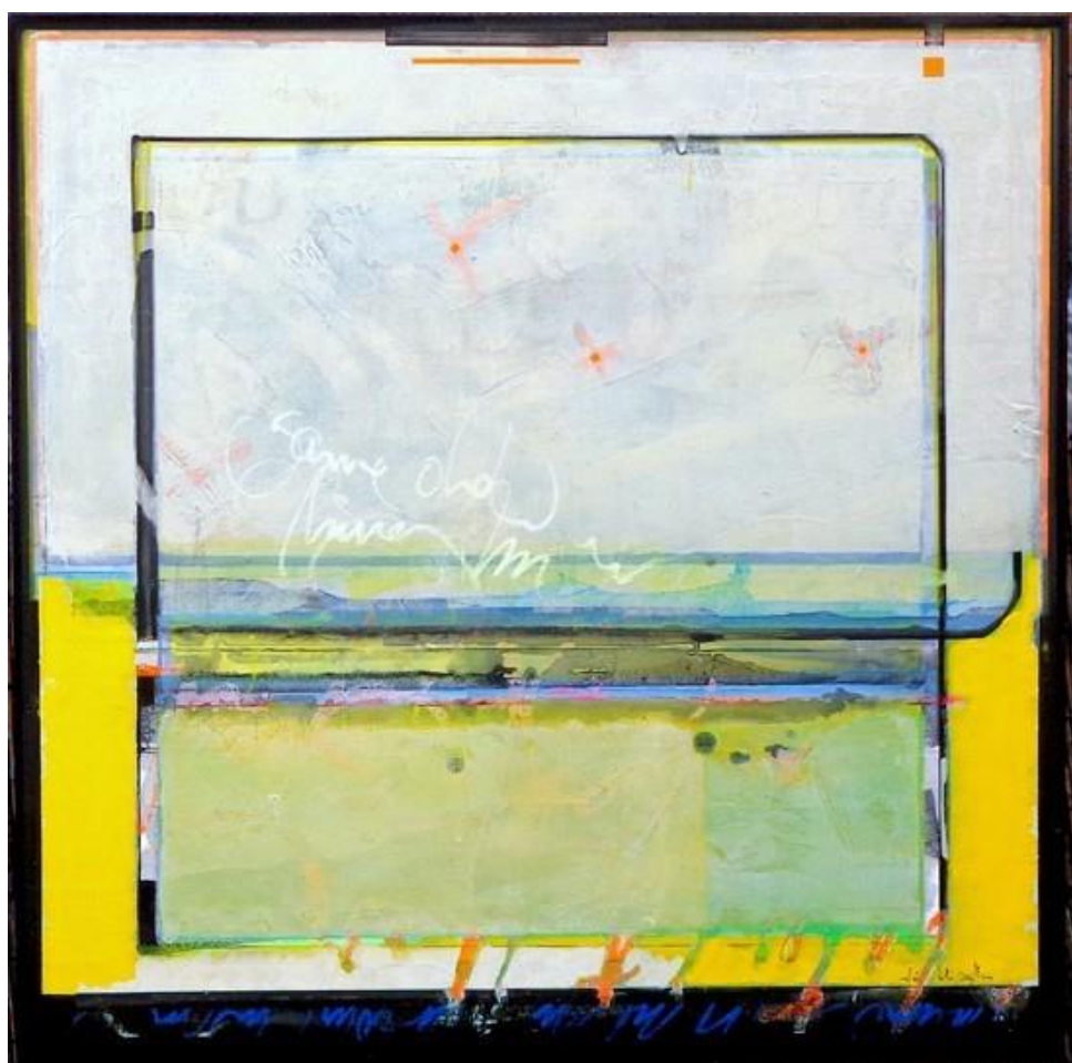
3/ Lapse, 100x100 cm, 2015