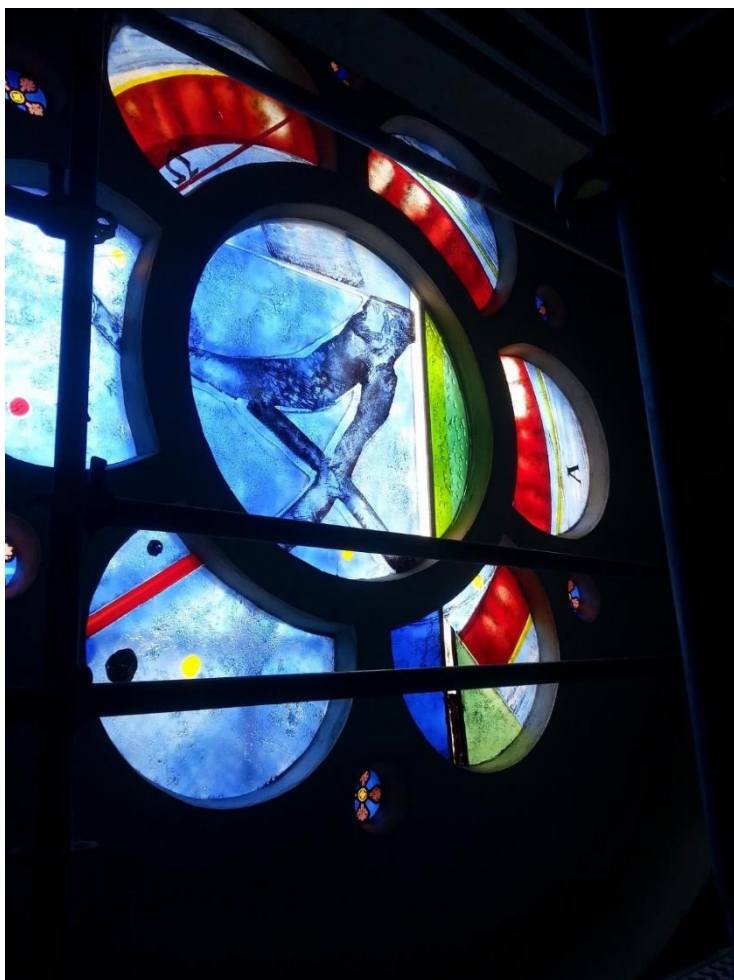
5/ Restoration of the rose shape stained-glass window on the front of the church Saint Maclou in Conflans Sainte Honorine, 2015